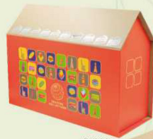
P2322 Size : 300 x 130 x 220 mm