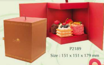
P2189 Size : 151 x 151 x 179 mm