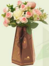
P2278 Size : 120 x 106 x 145 mm