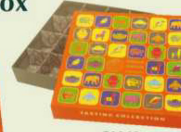
P2362 Size : 180 x 180 x 35 mm