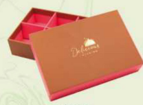
P2359 Size : 140 x 90 x 30 mm