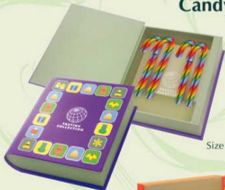
P1691 Size : 75 x 50 x 83 mm