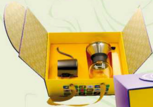
Hotel Welcome Kit Set P2392 Size: 290 x 210 x 135 mm