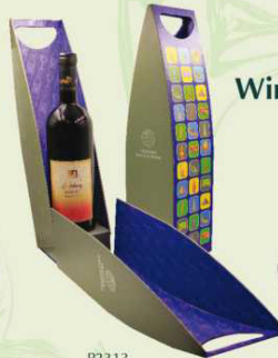
P2313 Size: 100 x 100 x 400 mm