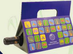
P2235 Size: 245 x 120 x 195 mm