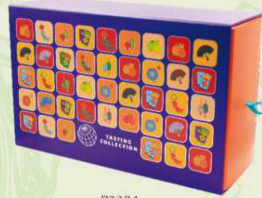
P2384 Size: 270 x 170 x 90 mm