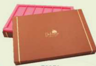
P2371 Size : 240 x 160 x 50 mm