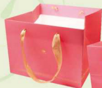
Gift Bag (Small/Big) P1936 Size : 245 x 238 x 180 mm P1937 Size : 300 x 210 x 198 mm