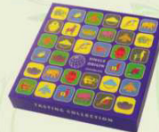
P2362 Size : 180 x 180 x 35 mm