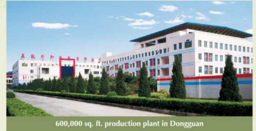
600,000 sq. ft. production plant in Dongguan

Our 600,000 sq. ft. production plant in Dongguan, China is staffed by skillful workers and has been awarded the ISO 9001, ISO 14001, BRC, FSC qualifications; and is an approved supplier for many international brand name companies.