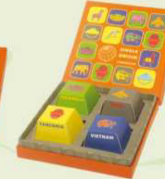
P1932 Size : 127 x 127 x 40 mm