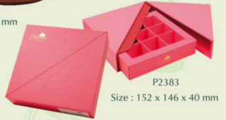
P2383 Size : 152 x 146 x 40 mm