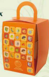
P2394 Size: 130 x 135 x 195 mm