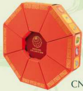
P2379 Size: 165 x 120 x 120 mm