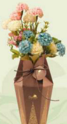
P2279 Size : 245 x 120 x 106 mm