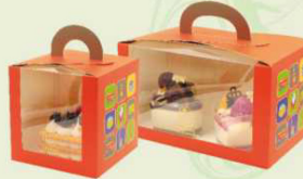
P2363A Size : 110 x 110 x 144 mm P2363B Size : 190 x 106 x 144 mm