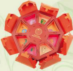
CNY Candy Tray P1985 Size: 185 x 200 x 45 mm