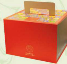
P2357 Size : 250 x 250 x 173 mm