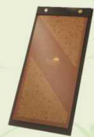
PU Menu P2265 Size : 12 x 140 x 300 mm