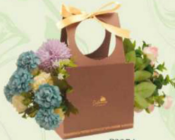
P2274 Size : 146 x 80 x 230 mm