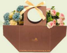
P2276 Size : 318 x 110 x 230 mm