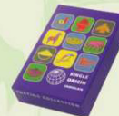
P2359 Size : 140 x 90 x 30 mm