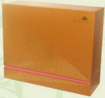
Whisky Box P2331 Size : 300 x 100 x 250 mm