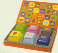
P1933 Size : 180 x 130 x 40 mm