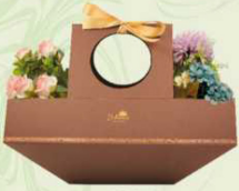
P2275 Size : 320 x 103 x 260 mm