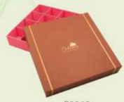
P2362 Size : 180 x 180 x 35 mm