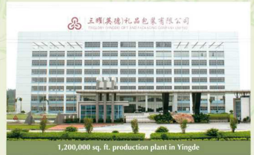
1,200,000 sq. ft. production plant in Yingde

Our 600,000 sq. ft. production plant in Dongguan, China is staffed by skillful workers and has been awarded the ISO 9001, ISO 14001, BRC, FSC qualifications; and is an approved supplier for many international brand name companies.