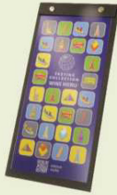
PU Menu P2265 Size: 12 x 140 x 300 mm