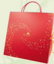
Advent Calendar P2076 Size : 282 x 282 x 41 mm