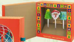
P1967 Size : 170 x 170 x 80 mm