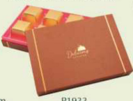
P1933 Size : 180 x 130 x 40 mm