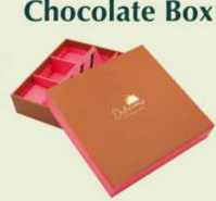
P2361 Size : 135 x 135 x 30 mm